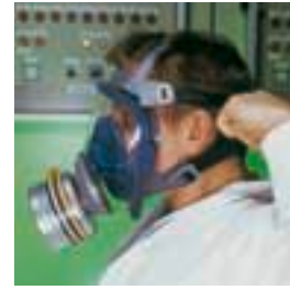
Tighten the straps