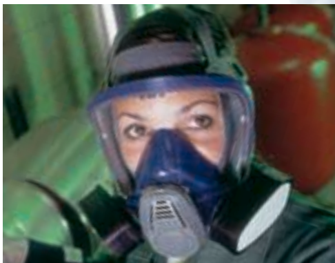
Advantage 3200 with TabTec® Gas Filter