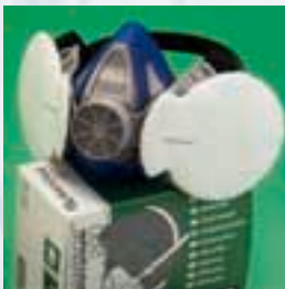
Particle, Gas and Combination Filters for the Advantage 200 LS

For storage and transport of the mask, the Advantage belt pouch provides a perfect solution.