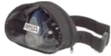
The convenient belt pouch is ideal for storing and carrying the Advantage 200 LS and its filters