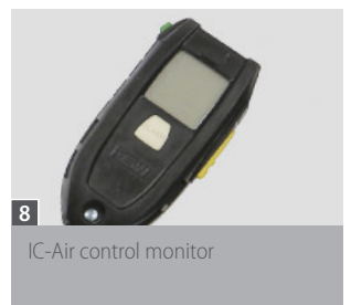
8 IC-Air control monitor