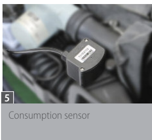
5 Consumption sensor