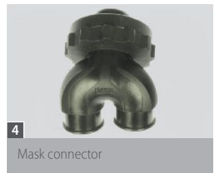
4 Mask connector