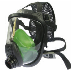
Advantage 4000 AirElite