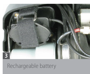
3 Rechargeable battery