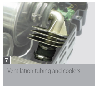
7 Ventilation tubing and coolers