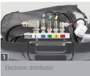
1 Electronic distributor