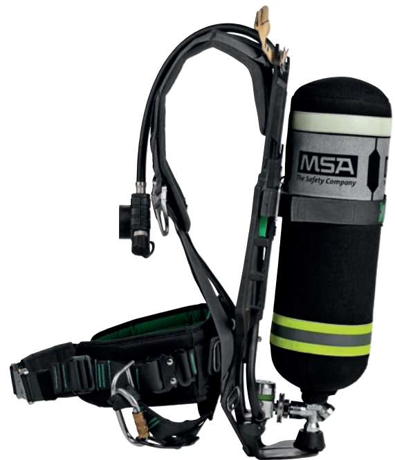
alphaBELT Pro mounted on AirMaXX SCBA